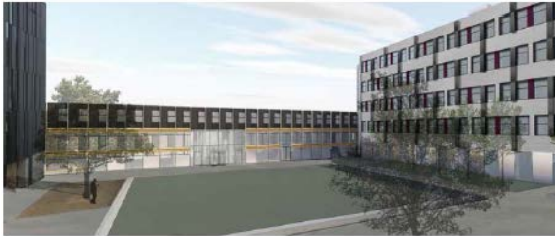
Clerici Building façade proposed view from Courtyard