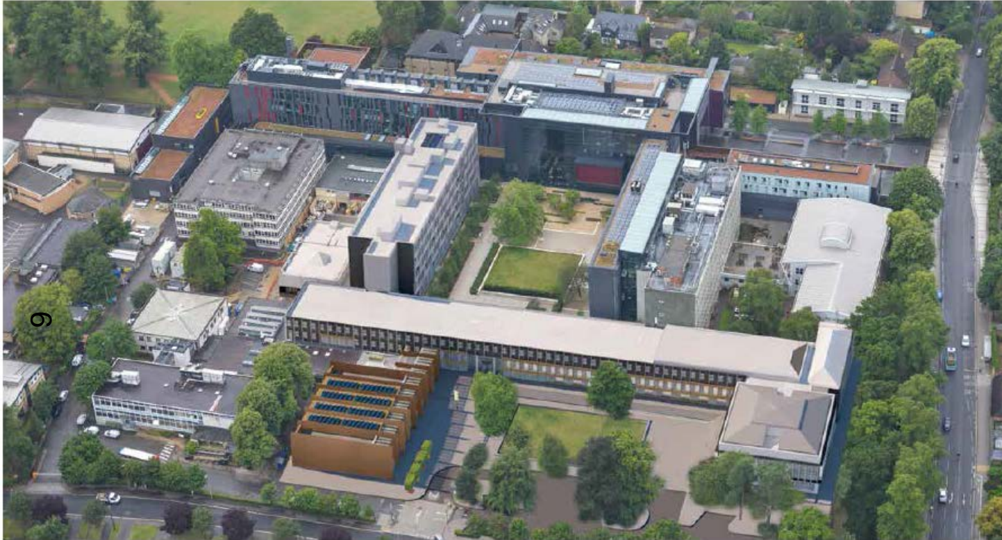
Proposed Aerial View