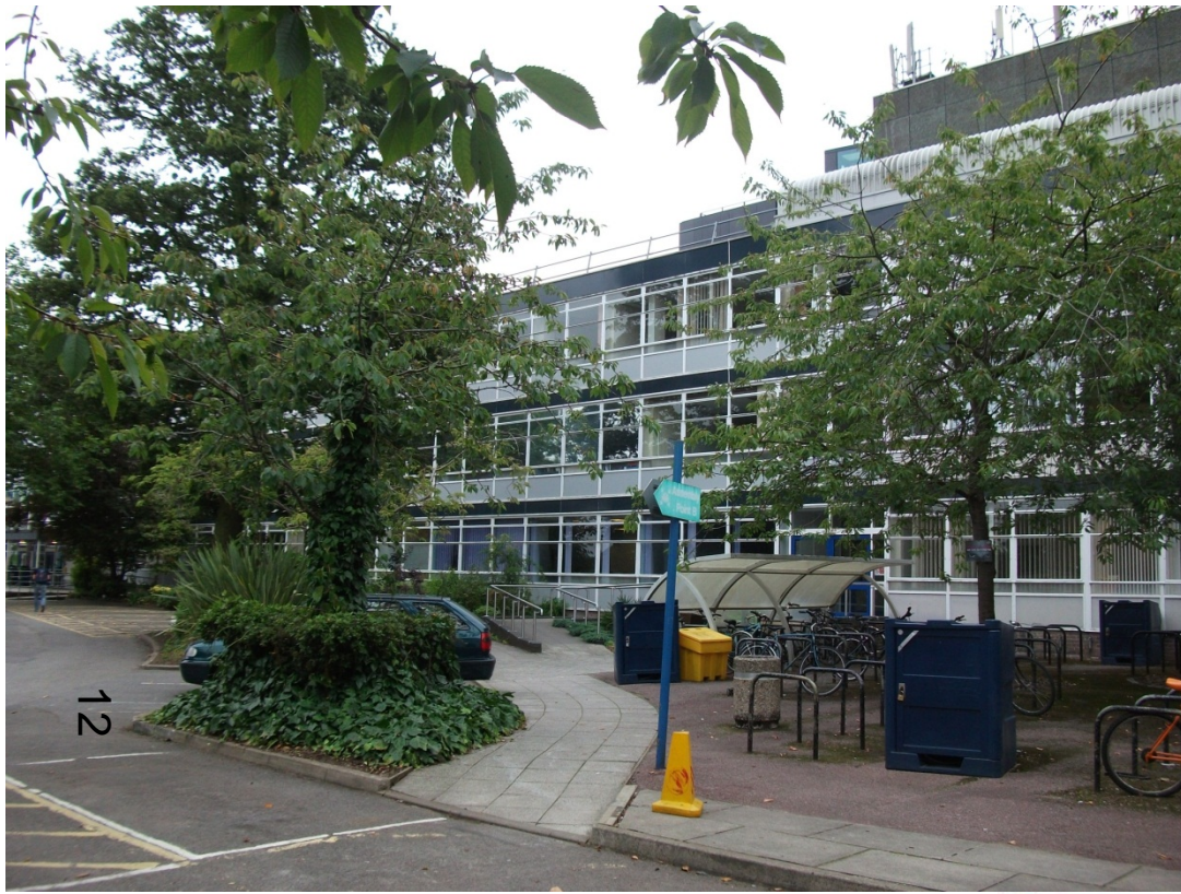
Clerici Building façade existing