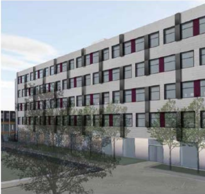
Sinclair Building façade proposed