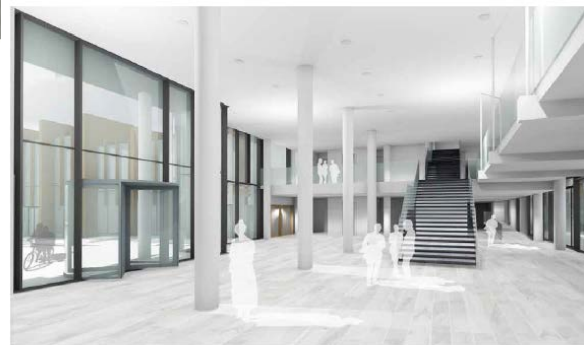
The Gateway Entrance