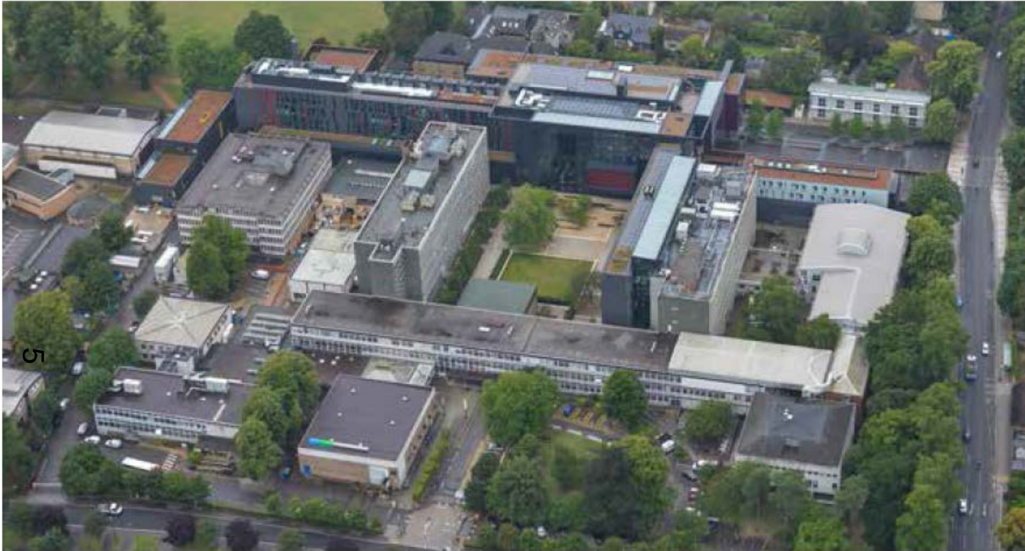
Existing Aerial View