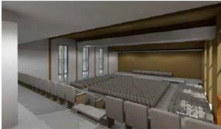
6 Main Hall proposal