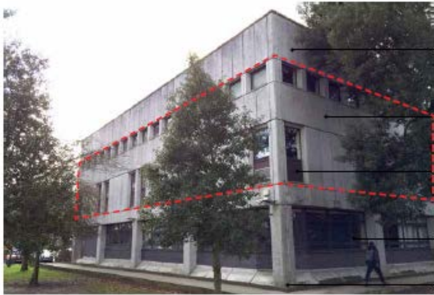
Former Library Building façade existing