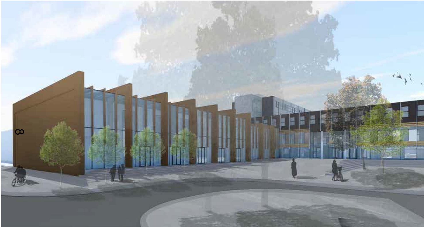
Main Hall façade proposal, view from Gypsy Lane