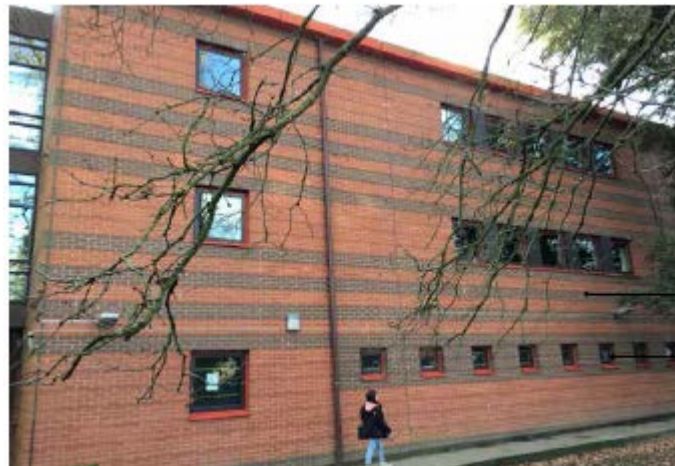
Library Extension façade existing