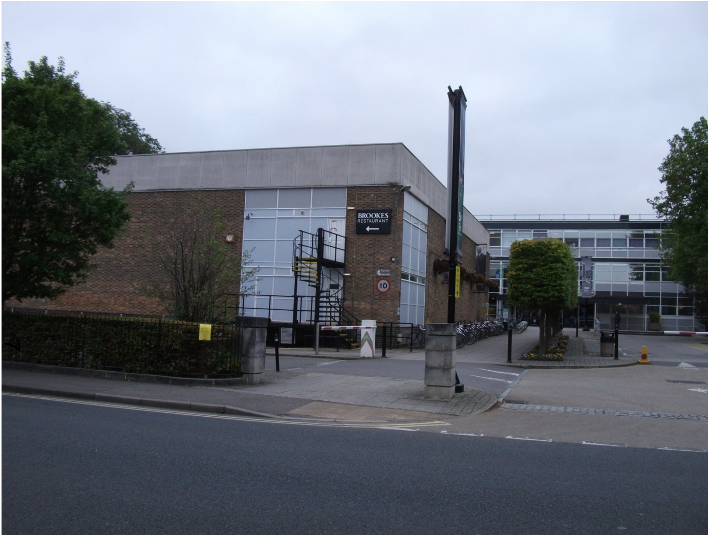
Main Hall façade existing, view from Gipsy Lane