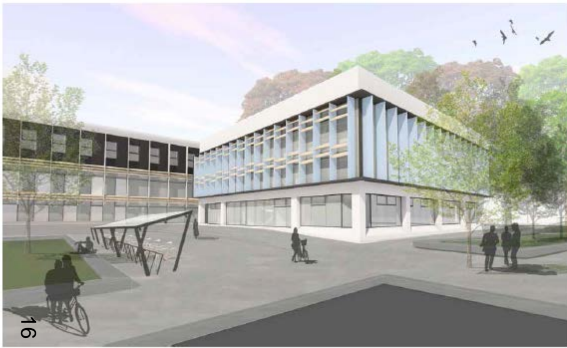
Former Library Building facade proposal, view from Gypsy Lane