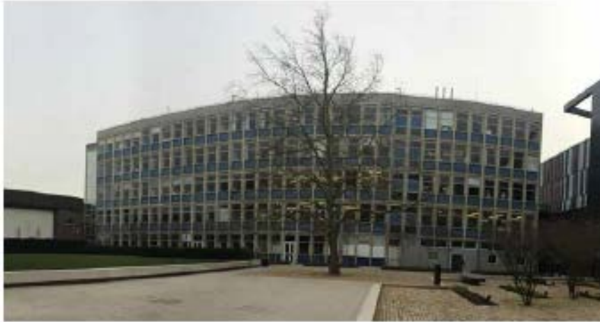
Sinclair Building façade existing